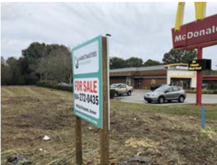
Picture from Blanding Blvd. looking toward the back of the property, next door to McDonald's.