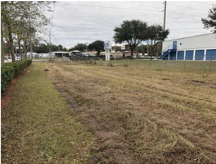
Picture from back of lot looking toward Blanding Blvd. 35' wide strip.